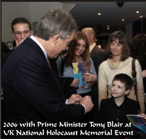
2006 with Prime Minister Tony Blair at UK National Holocaust Memorial Event